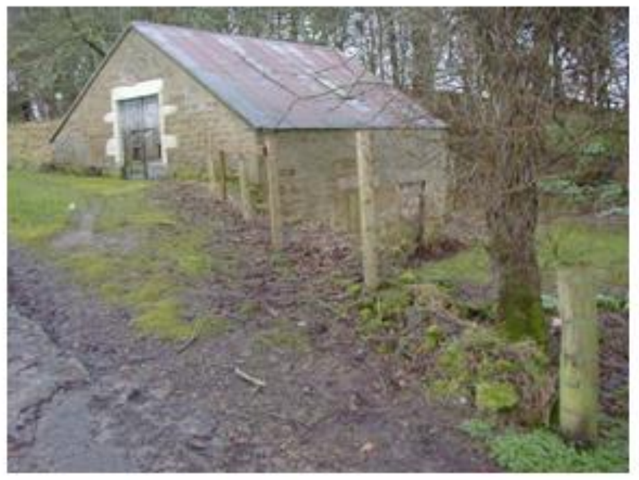
Figure 11: Old Bridge; Findon Mills, R. Piercy