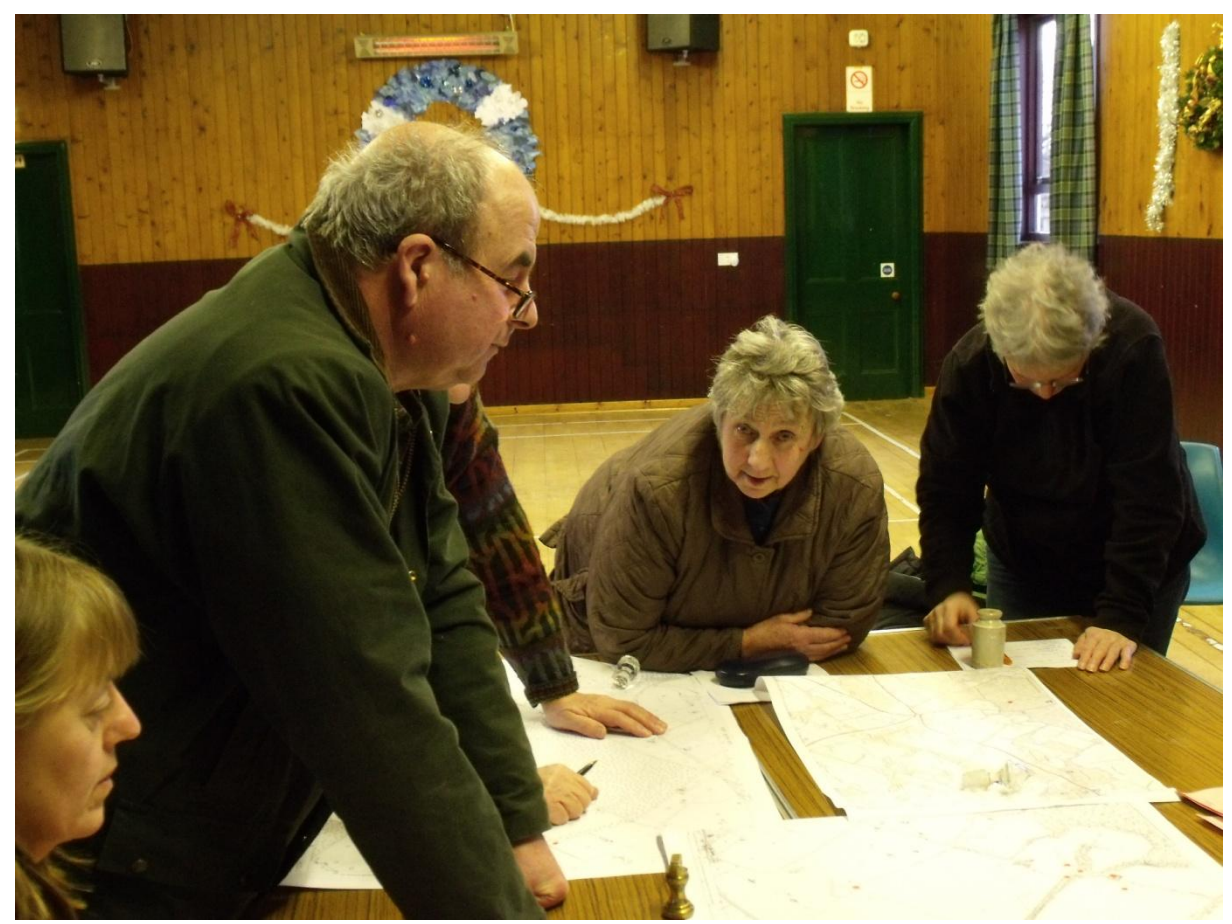
Figure 2: Participants at Tore

173 records of sites, buildings and features cited in the Highland Council's Historic Environment Record (HER) were updated with new information. 127 new records were generated for entry into the HER.