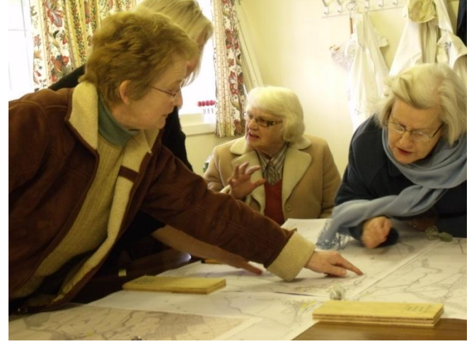
Figure 4: Participants at Avoch

From the Gaelic An Todhar, 'The bleaching spot', the village is located seven miles north of Inverness at NH 60257 52487 (centred), and is positioned around a major roundabout where the A9 intersects the A832 and the A835. Whilst the current settlement of Tore is thus divided by the main road intersections, the original village is located to the east of this roundabout at NH 60507 52482 (centred) and comprises mainly of post-medieval farm and crofting buildings.