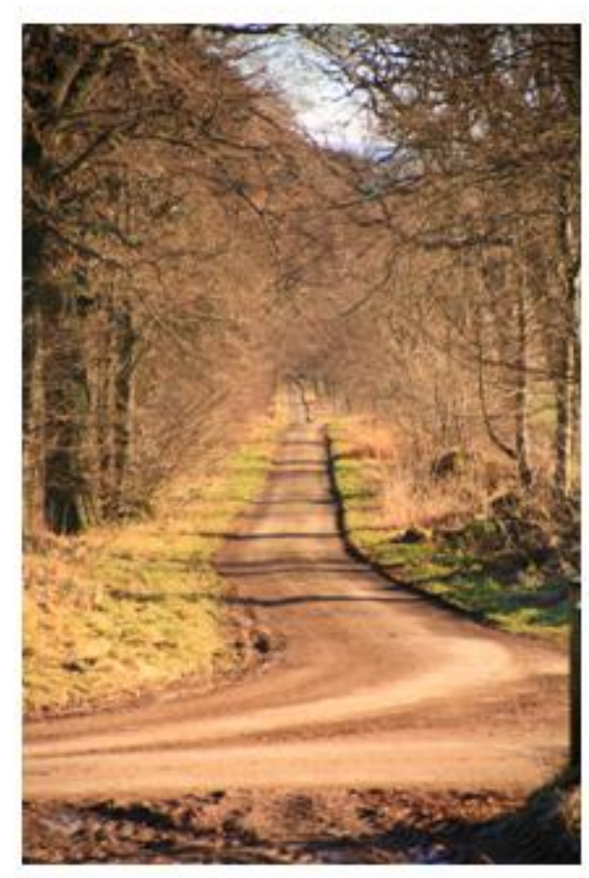
Figure 5: Tore Castle, A. Cameron