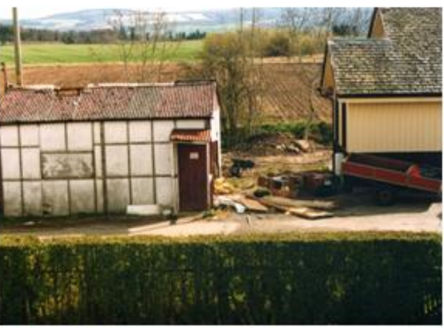
Figures 7 and 8: Killearnan Post Office; Redcastle, A. MacKay